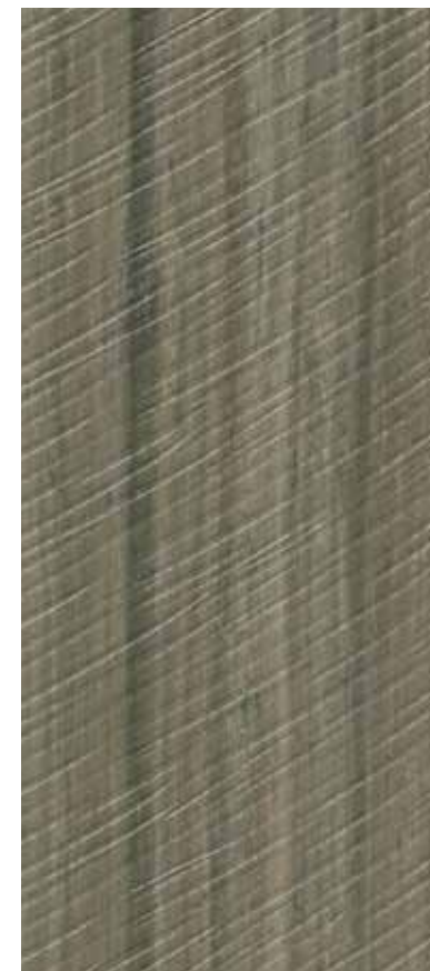
te5231 | Cliffs of Moher LRV 17% 100 x 25 cm NCS S 6005 - Y20R