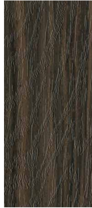
te5218 | Welsh moor LRV 8% 100 x 25 cm NCS S 8005 - Y80R