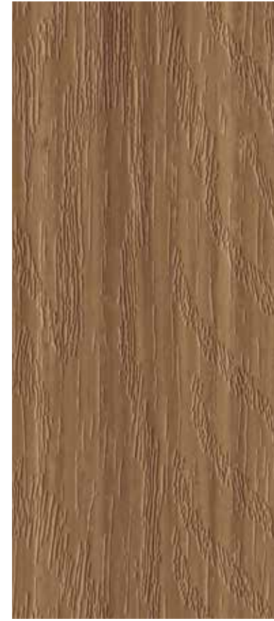
te5229 | fresh walnut LRV 15% 100 x 25 cm NCS S 6020 - Y50R