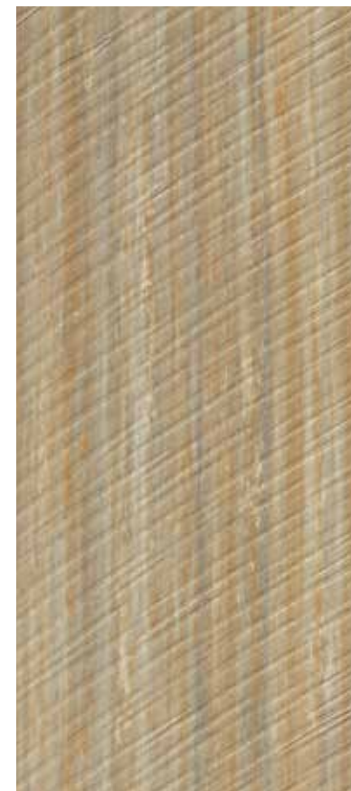
te5225 | compressed time LRV 34% 100 x 25 cm NCS S 4010 - Y30R