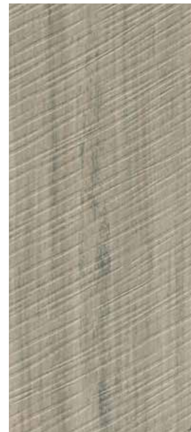
te3573 | trace of nature LRV 27% 100 x 25 cm NCS 5005 - Y20R