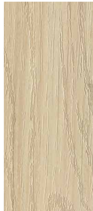
te5230 | white wash LRV 49% 100 x 25 cm NCS S 2010 - Y30R