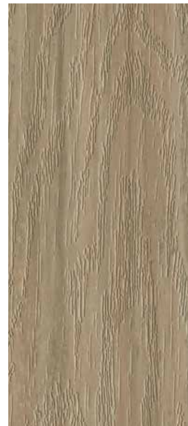
te5217 | withered prairie LRV 23% 100 x 25 cm NCS S 5010 - Y30R