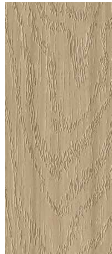
te5235 | North Sea coast LRV 32% 100 x 25 cm NCS S 4010 - Y30R