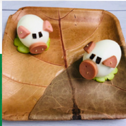
Products from calotropis gigantea leaves