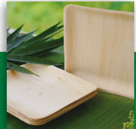
Products from Areca leaves