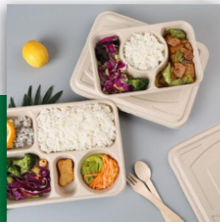
Take-away food container from sugarcane bagasse