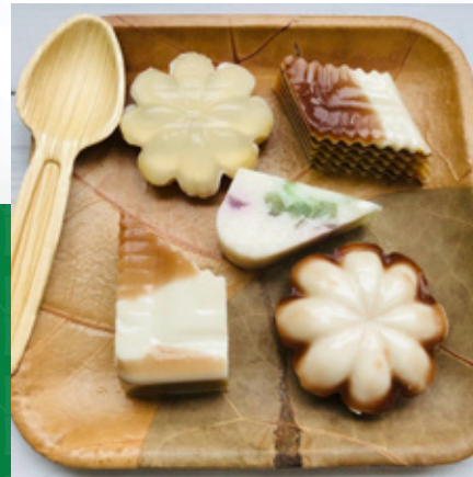
Products from calotropis gigantea leaves