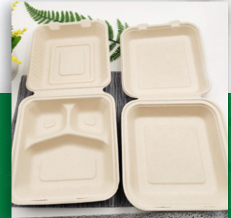
Take-away food container from sugarcane bagasse