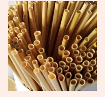
Offers only one-size fits all