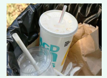
Food-contaminated – not accepted by recyclers