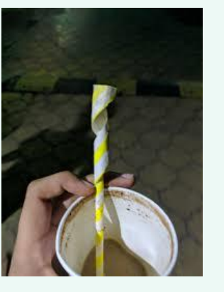
Unravels, disintegrates, breaks down, goes limp.