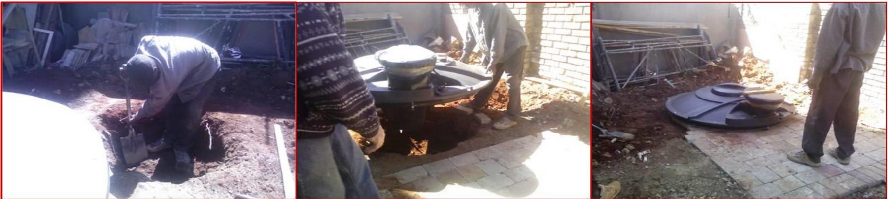
Quick and easy installation – into any structure, any soil, small spaces

Business opportunities exist in the 'servicing' (removal of dried waste).