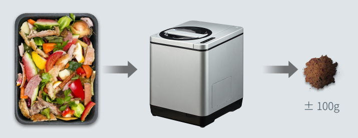
Food waste 1kg