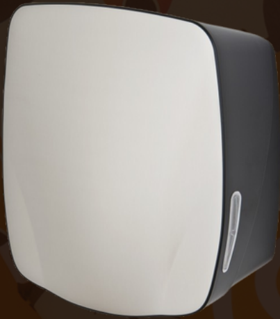
Paper towels (Z-fold)

These luxury dispensers are made of a stainless steel front, making them very strong and giving them a very elegant look. On the side you will find small windows, through which you can keep track of the stock. These dispensers are available without stickering or with black 'The Good Roll' stickering.