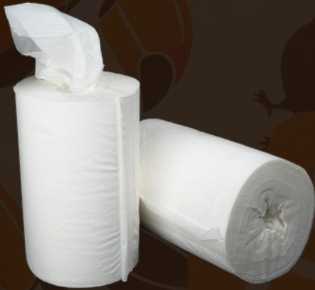
Mini, 120 meter